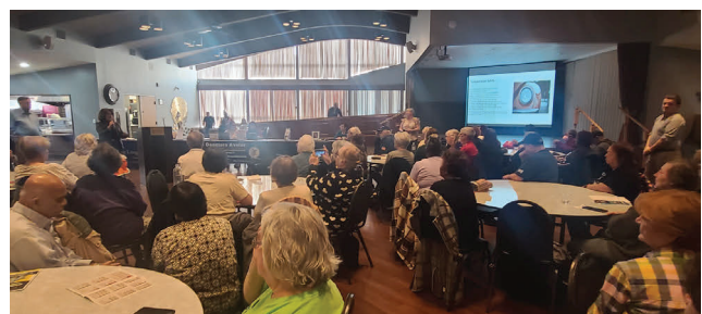
Senior Safety Presentation