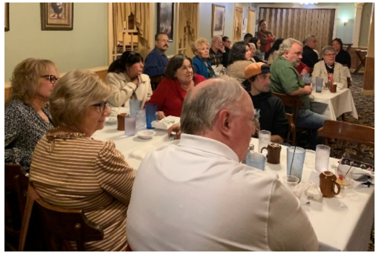
Staff and Volunteers

For information, contact Dave Locke at 815-886-7986.